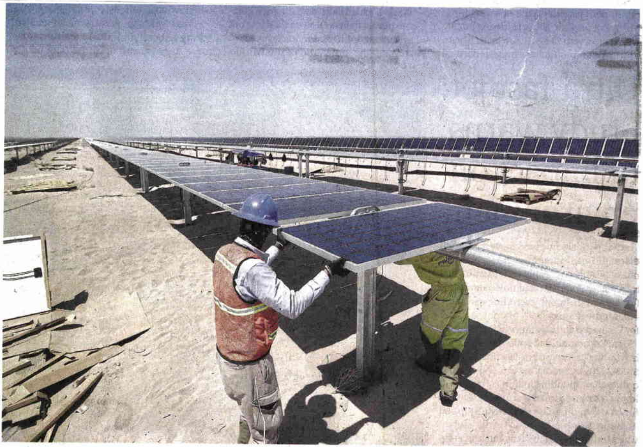
BELOW Workers install new solar panels at the Villanueva photovoltaic (PV) power plant.

are together reshaping the solar market in Mexico.